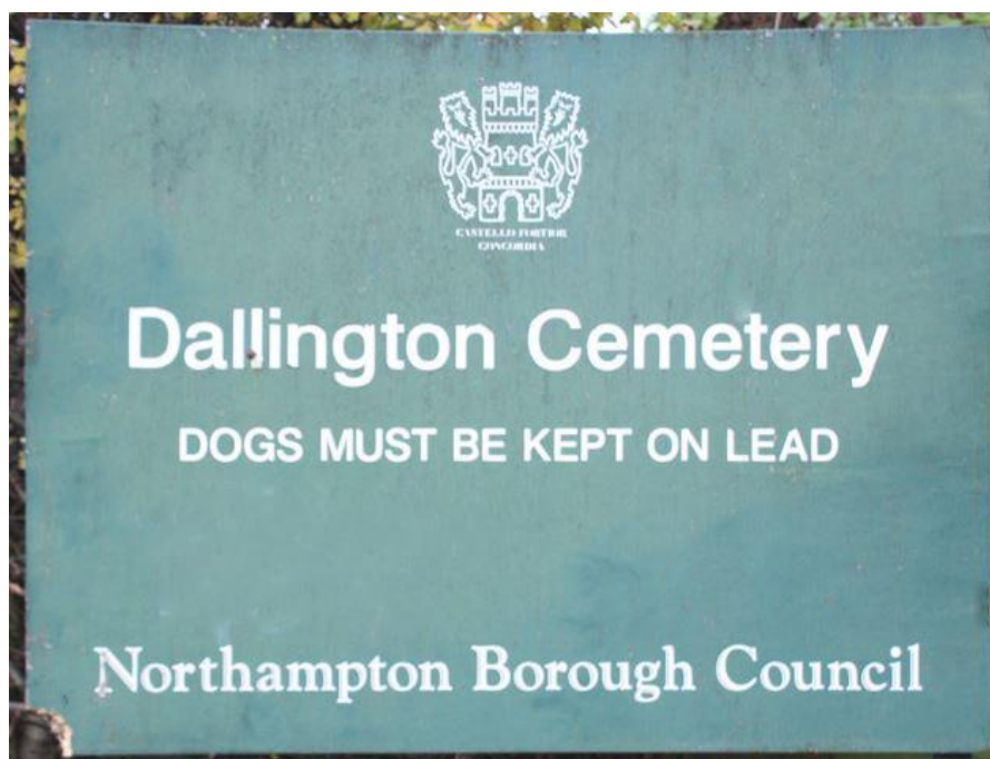
Dallington Cemetery, Northampton

Dallington Cemetery, Northampton contains 30 Commonwealth War Graves – 14 from World War 1 & 16 from World War 2.