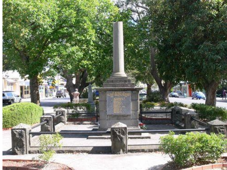
Meeniyah Cenotaph